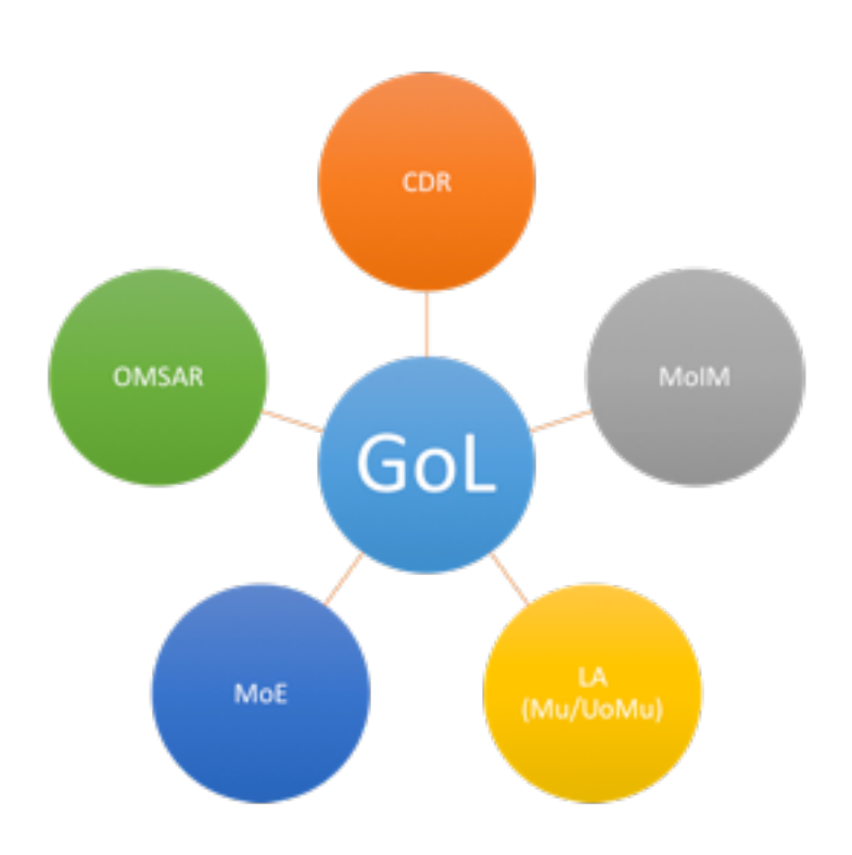
Figure 2 Key governmental actors SWM: MoE, OMSAR, CDR, MoIM, Local Authorities (LA) (Municipalities (Mu)/ Unions of Municipalities (UoMu)).

Lebanon.<sup>104</sup> Additionally, the different ministerial entities responsible for elaborating the solid waste strategies have shaped the outcome of the plans.