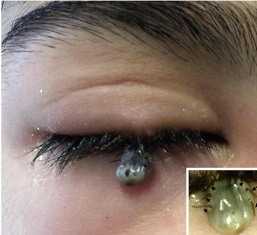
Fig. 1. Right periorbital swelling and redness with eyelid ptosis are shown. A large tick is seen with the dorsal side abutting the lower lid and the ventral side showing the inferior part with three pairs of legs ( inset ). The upper ventral side has its hypostome (central piercing element having hooks) inserted deep into the upper tarsus providing a very strong anchor to its host.