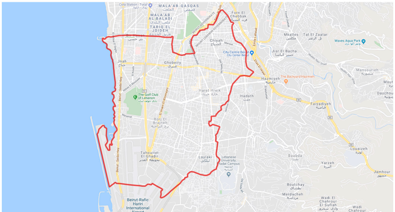
Fig. 1. Map of municipalities and urban quarters in Dahiyeh (Google Maps, 18/01/2019).