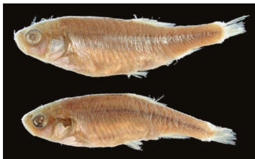
Fig. 2. Pseudophoxinus libani , MCZ 25546, syntypes; Lebanon: Yammouneh basin. (Photograph from MCZ Ichthyology, © President and Fellows of Harvard College).

The syntypes of P. libani (SMF 804) were distorted and had been dry once. They look similar to the photograph available online at MCZ (MCZ 25546) database (Fig. 2). We did not examine all syntypes since their examination did not allow to distinguish them from the other studied specimens by any of the characters listed in Tables 1 and 2.