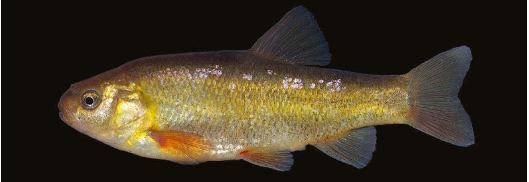
Fig. 5. Pseudophoxinus libani , FSJF 3263, about 90 mm SL; Lebanon: spring south of Yammouneh, male with long paired fins and subterminal mouth.