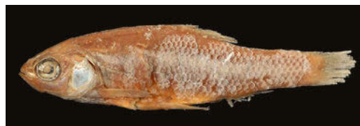
Fig. 3. Pseudophoxinus libani, MNHN-IC-1910-0018, lectotype of P. kervillei ; Syria: Homs.