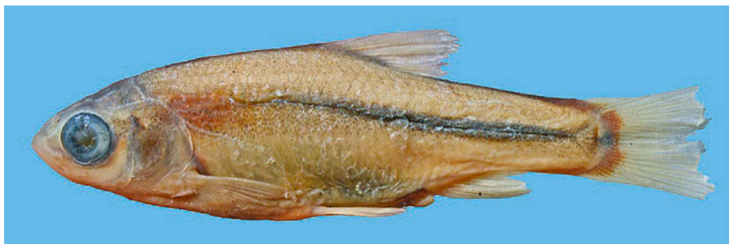
Fig. 4. Pseudophoxinus libani , FSJF 2641, 36 mm SL; Syria: Orontes, north of Ain al Zarqa; juvenile showing position of dorsal-fin origin.

The most important character states to distinguish P. kervillei from P. libani is the position of the dorsal fin and the number of scales along the longitudinal line (Pellegrin, 1911, 1923; Krupp, 1985). There is a large variability in the position of the dorsal- and pelvic-fin origins in fishes from the Orontes and Litani. The dorsal-fin origin is situated slightly behind the pelvic-fin origin in some individuals, but is usually clearly situated behind the pelvic-fin base.