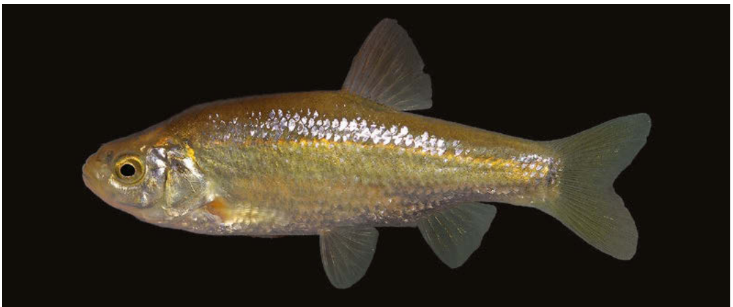
Fig. 7. Pseudophoxinus libani , FSJF 2644, 72 mm SL; Syria: Orontes at Al Qusayr.