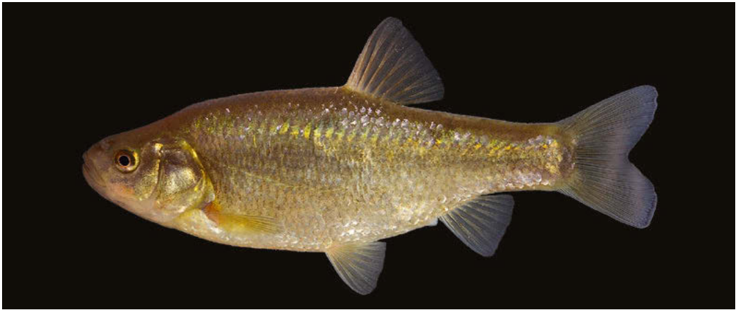
Fig. 6. Pseudophoxinus libani , FSJF 3267, 92 mm SL; Lebanon: spring canal at western margin of Ammik marshes, Litani drainage; female with short paired fins and slightly upwards directed mouth.