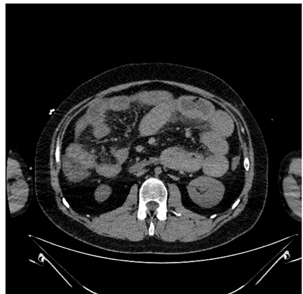
Fig. 3. CT image.