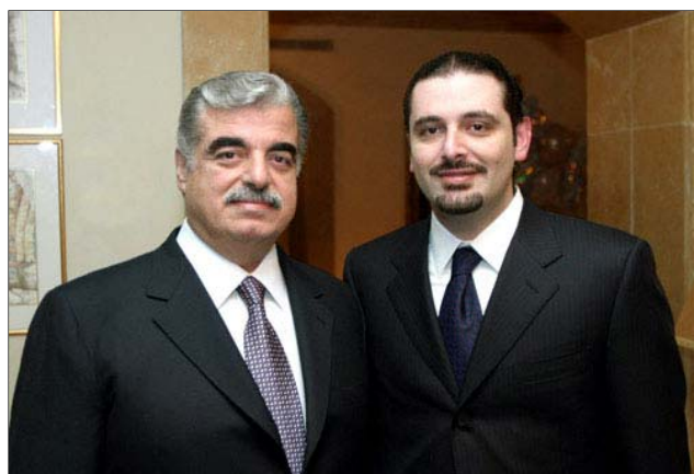
Rafiq Hariri (left) and his son Saad. After a long period of Shiite ascendancy, the prominence of Rafiq Hariri revived Sunni political hopes in Lebanon, but his assassination in February 2005 crushed expectations. In May 2008, Hezbollah stormed mostly Sunni west Beirut and liquidated the militia of the Future Trend movement, headed by Hariri's son Saad. However, Sunni hopes were renewed when the Sunni ISIS offensive took control of a large swath of Iraqi territory in June 2014.

The claim by a recent public opinion poll that only 1 percent of adult Lebanese Sunnis are supportive of the self-proclaimed Islamic State of Iraq and Syria (ISIS) 1 must be taken with a large pinch of salt since “there is a vast gulf between how people say they behave and how they actually behave.” 2 In fact, since Lebanese Sunnis are willing to support whoever can defeat their enemies and restore their pride, many of them find ISIS appealing for quite a few reasons: They have an aversion to Shiites and feel estranged from the Lebanese state while harboring nostalgia for the caliphate. Many admire power in any form, and others have a predisposition to anomic terrorism.