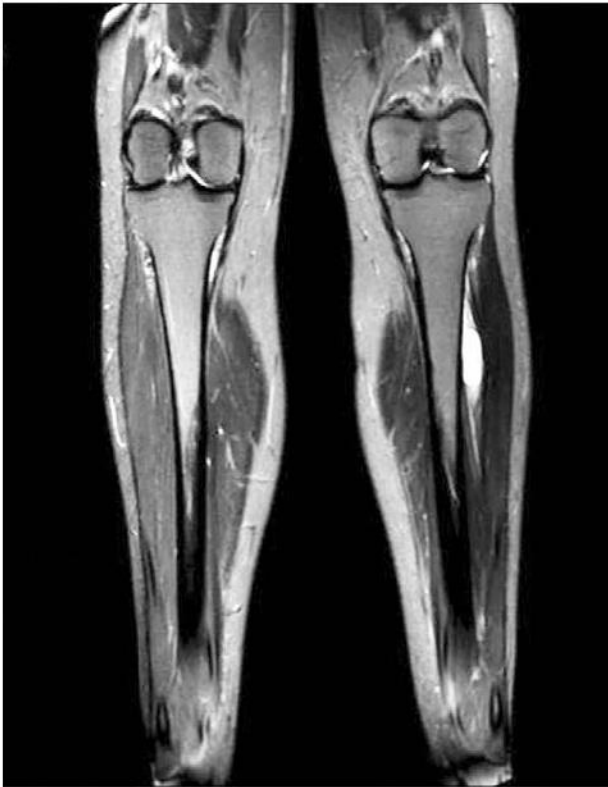
FIGURE 1b. Coronal T2-weighted MRI of both legs showing a 2.9 x 2.3 x 1.2 cm lesion with high signal intensity within the proximal third of the tibialis anterior muscle of the left leg. The cortex of the tibia is shown to be intact.