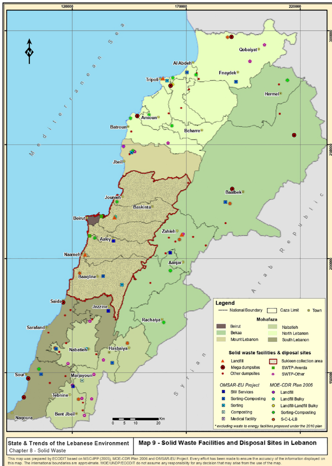
Figure 1. A map of solid waste management facilities in Lebanon.

administrative or funding processes to initiate these projects (Ministry of Environment, 2018). All this raises the question: how efficiently can MSWM services be decentralized in Lebanon and to what extent can the national government relinquish the ownership and operation of MSWM, replacing the centralized structure with smaller decentralized solid waste